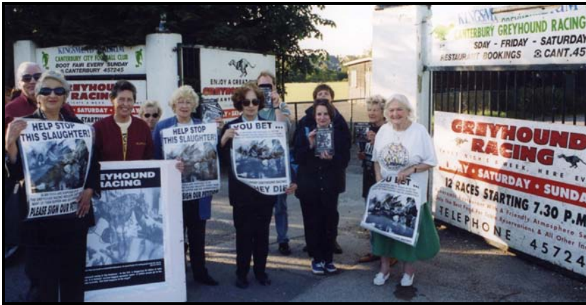
An early GA demo, outside Canterbury dog track (now closed) in 1999

It was in 1997 that we decided to form an organisation to campaign for an end to commercial greyhound racing.