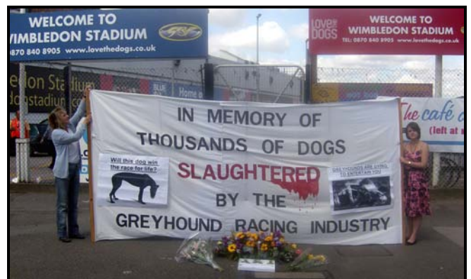
Greyhound Remembrance event at Wimbledon, one of the tracks which could be sold to developers

The Northern Ireland administration has ruled out plans for a greyhound stadium at Belfast's Ormeau Park.