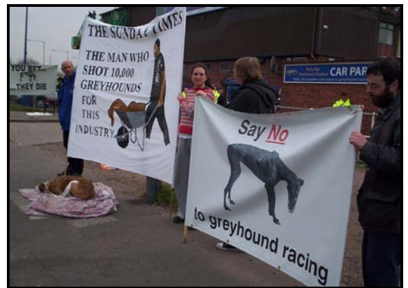
Demos earlier this year at Perry Barr, where attendances fell by 33%.....

A greyhound racing industry source is quoted as saying "The May figures are apparently even worse".