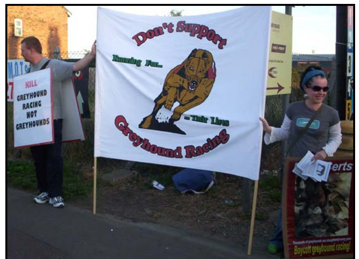
And a recent one - Peterborough Stadium, this September

Greyhound Action enters its second decade with commercial greyhound racing in a far weaker position than it was 10 years ago and we are quietly optimistic that the next 10 years will see this industry of death slide even closer towards oblivion.