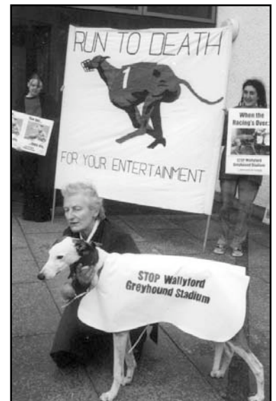
June 2002 – Protest outside East Lothian Council offices against plans for the Wallyford track

Edinburgh's previous greyhound track, at Powderhall Stadium, closed in the mid-1990s.