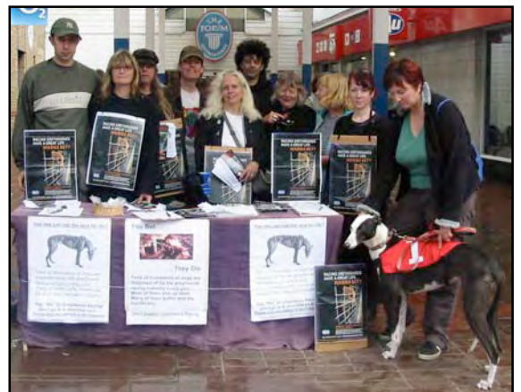
Greyhound Action stall in Sittingbourne shopping centre

Information from members of the public has enabled us to get considerable media coverage in many areas of the country about serious injuries to greyhounds on the tracks and some of the resulting newspaper articles have been made into leaflets for distribution outside the stadiums where these occurred.