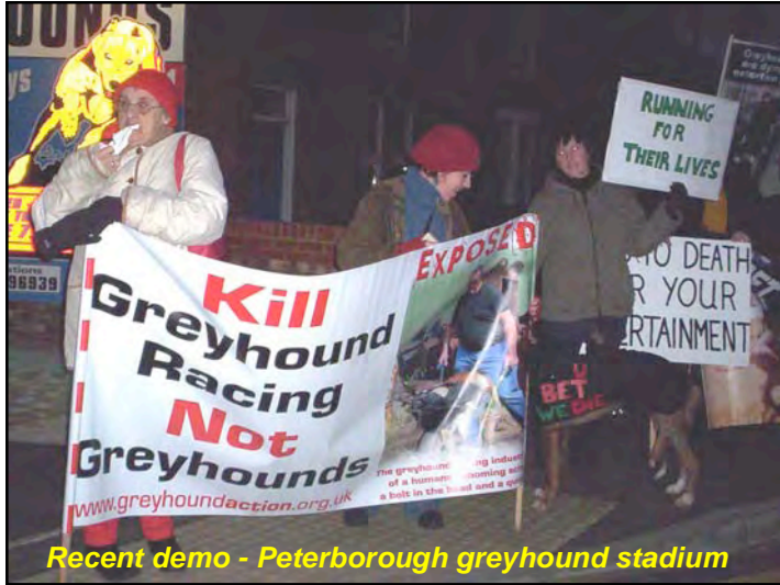
Recent demo - Peterborough greyhound stadium

Constant pressure exerted on the dog racing industry by Greyhound Action and other greyhound protection campaigners has resulted in a huge fall in the number of greyhounds put to death annually. 2007 breeding, racing and rehoming figures, just issued in Britain and Ireland, indicate that the number of greyhounds killed has fallen by as many as 5,000, when compared with previous years. This is mainly because the breeding of greyhounds has been reduced by about 13%, meaning that fewer are being produced to be ruthlessly discarded as pups or young dogs after failing to make the grade as racers.