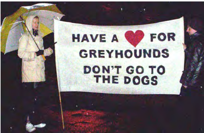
In all weathers – dedicated demonstrators have brought the Coventry track to the brink of closure

The greyhound track at Coventry Stadium is teetering on the brink of closure, after 4 years of regular Saturday demonstrations by local Greyhound Action supporters have reduced attendances to an abysmally low level, causing a financial crisis, which has led to prize money going missing and trainers not being paid. The track has already been forced to end its Friday night race meetings.