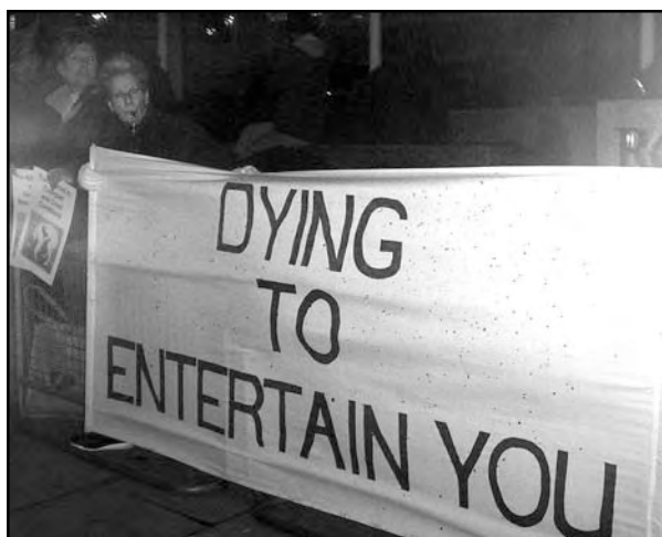
Demo outside the British Greyhound Racing Board's Annual Awards event at the Royal Lancaster Hotel, London in January.

On Sunday, April 27 th , northern representatives of the greyhound racing industry will be holding their annual awards ceremony (booze-up and banquet) at the Queens Hotel, City Square, Leeds LS1 1PL.